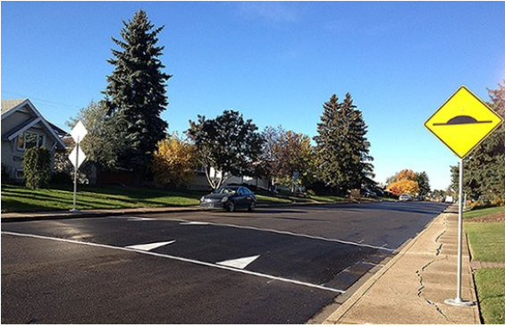
Example of a speed hump installation

The City of Edmonton has recently installed two speed humps in Meadowlark Park along 88 Avenue near 160 Street. These two permanent speed humps are aimed to curb excessive traffic volume and excessive speeds through the area.