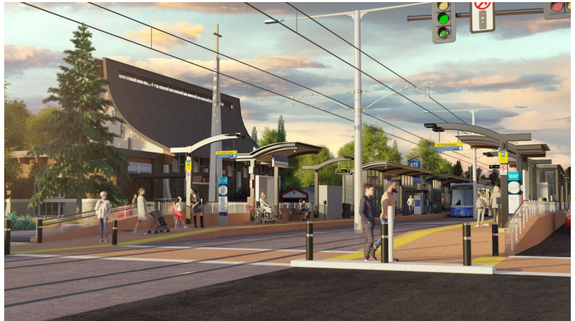
Concept drawing of Meadowlark Station on Valley Line West LRT

MIP is working along most of the alignment in 2023, including verifying ground conditions and performing general road maintenance. In the Meadowlark area, MIP continues drainage and road work along 156 Street and Meadowlark Road between 88 Avenue and 100 Avenue.